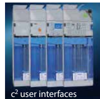
c 2 user interfaces