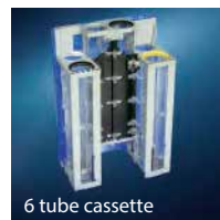
6 tube cassette