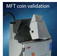
MFT coin validation